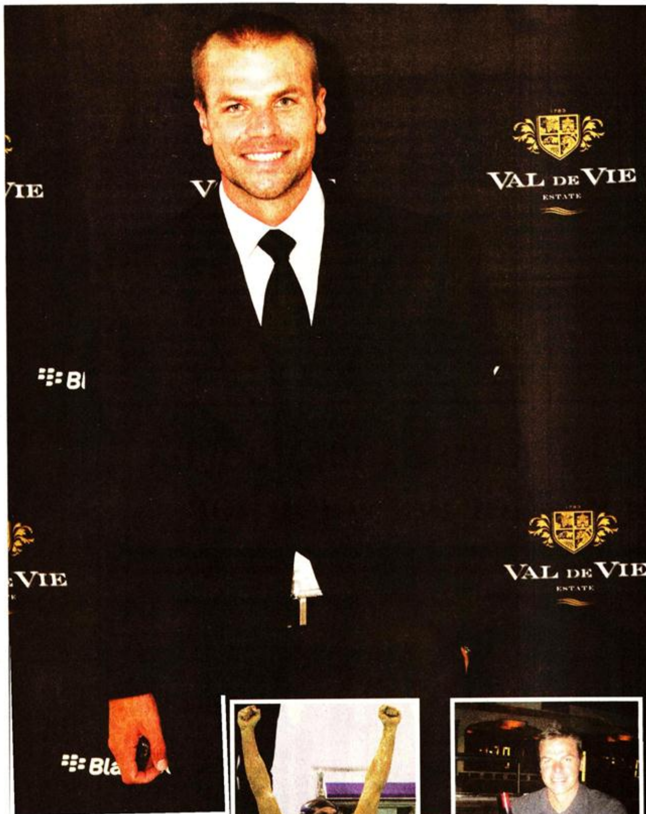
LOOKING GOOD: Ryk Neethling

on your tongue and it's sexy - it is named after Ryk, after all. It should definitely be paired with meat; be it kudu medallions, duck or a good steak. It comes highly recommended.